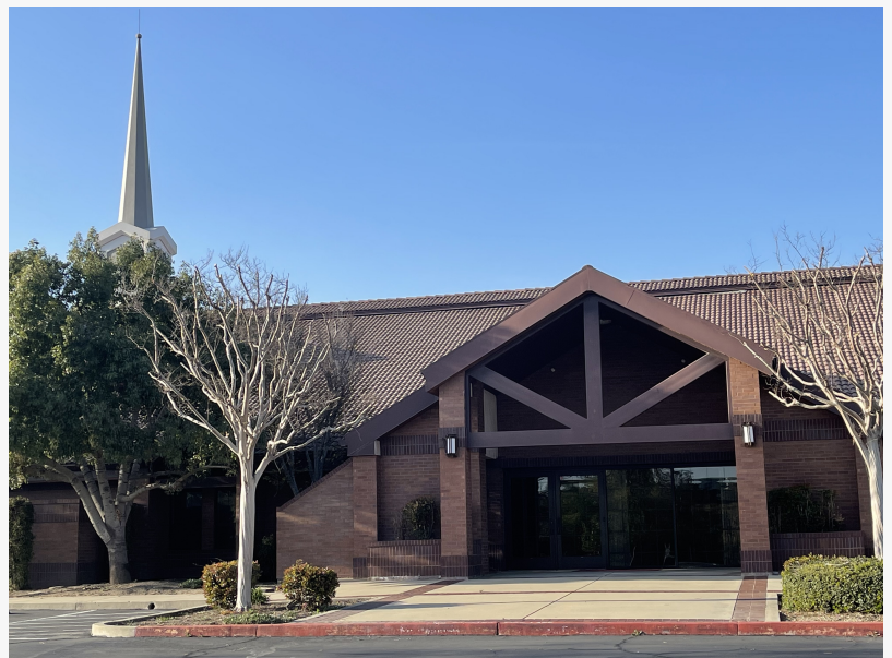
The Church of Jesus Christ of Latter-day Saints Chino Stake www.churchofjesuschrist.org and www.ComeuntoChrist.org