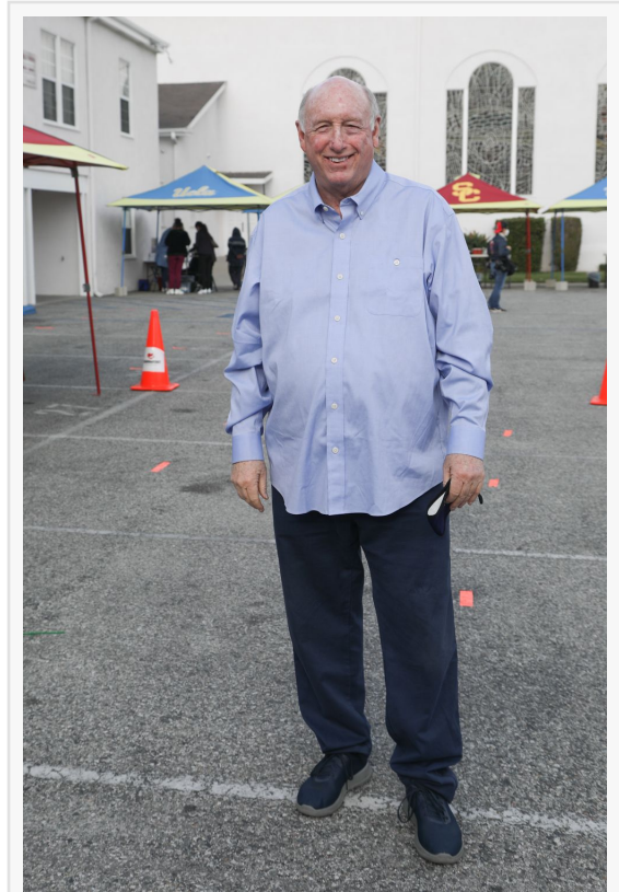
Phil Brock, Santa Monica City Councilmember comes out to support the No Cost COVID-19 Antibody Testing at Calvary Baptist Church Santa Monica

This press release can be viewed online at: https://www.einpresswire.com/article/536547274