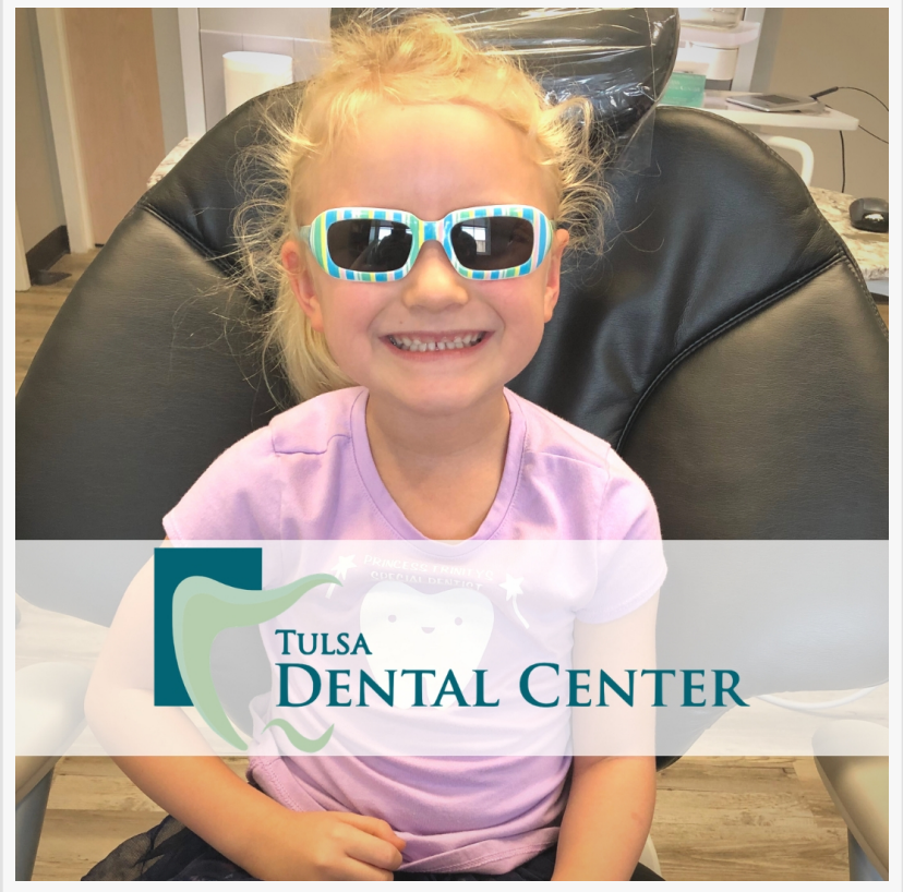
Even Children Enjoy Their Dental Appointments at Tulsa Dental Center