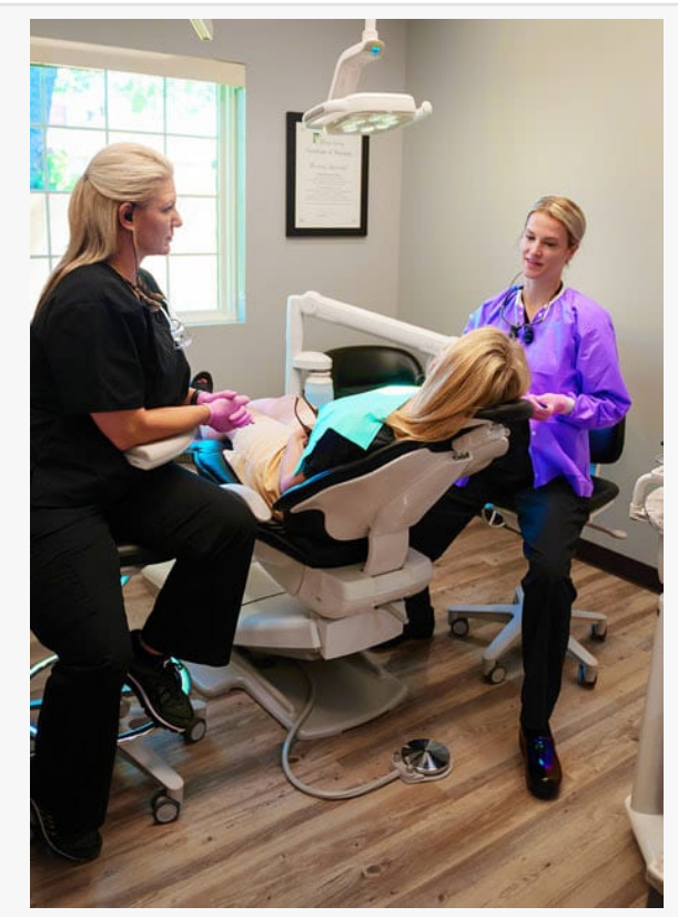
Tulsa Dental Center's team of professional staff makes you feel at home.