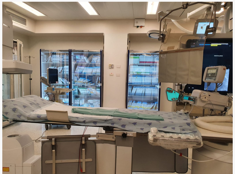
IDENTI's Smart Cabinet system and integrated AI management software to track and manage hydrocephalus implants for DH's customer, Medtronic Mexico.