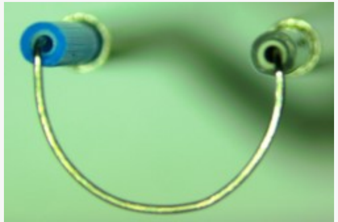
PreCise UltraThin™ for TURBT