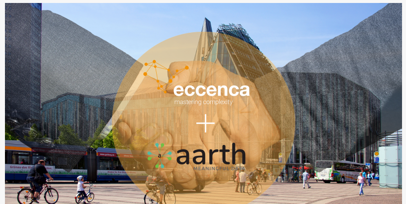
eccenca & Aarth cooperate

Software, a leading digital transformation company, partners with eccenca as a solution provider for semantic data management. Aarth is committed to mature an organization's understanding of data and transform decision making with meaningful insights. They will use the semantic data management platform solution by eccenca in projects where customers strive for better data quality and process understanding to leverage automation and artificial intelligence solutions.