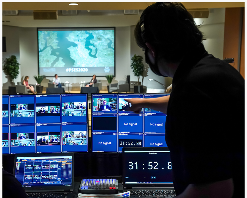
Virtual Studio and Command Center from AVMS