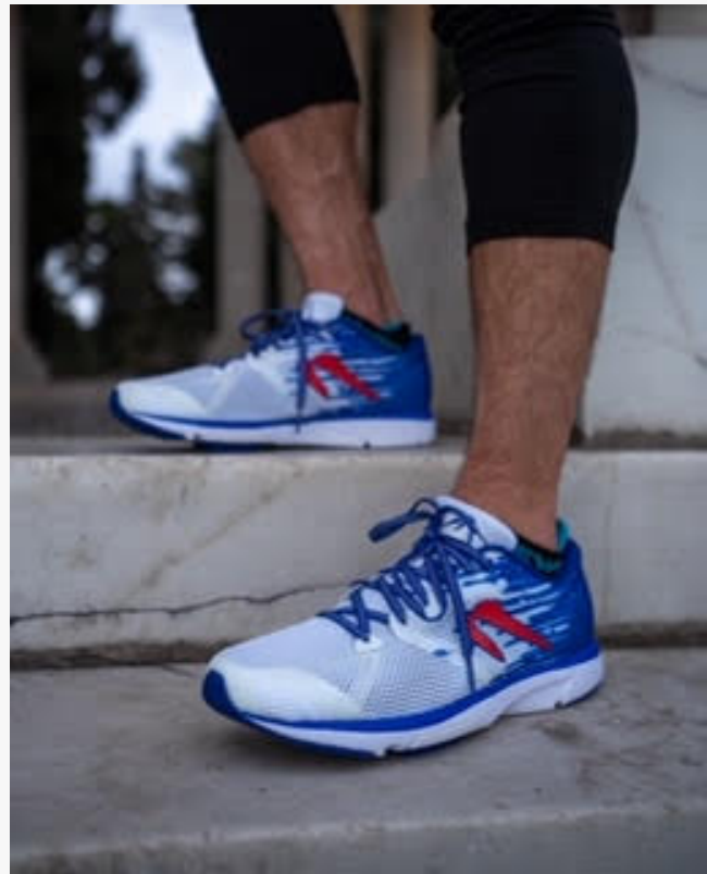
NEWTON RUNNING DISTANCE 10 II