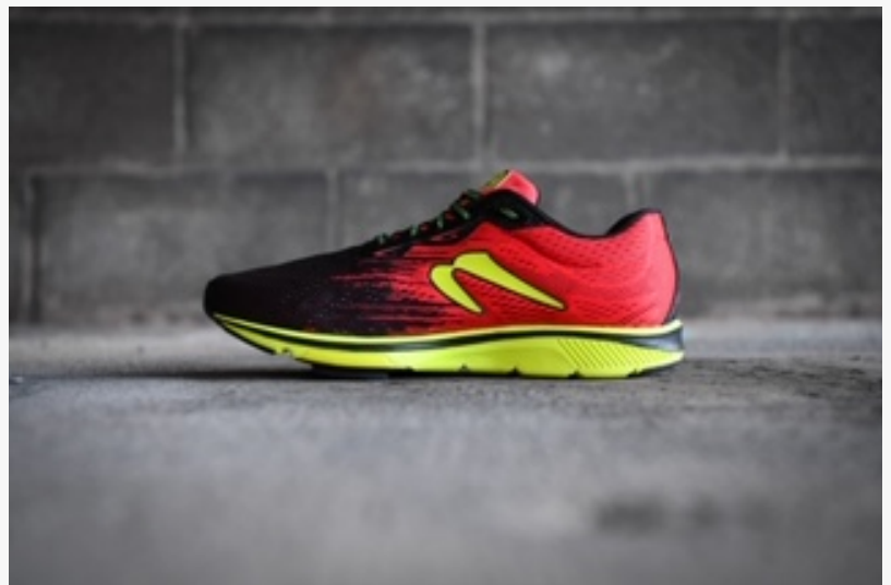
NEWTON RUNNING GRAVITY 10