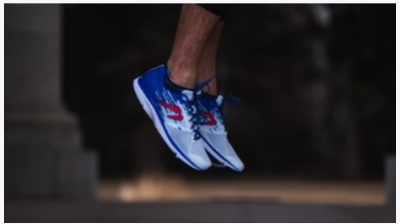
NEWTON RUNNING DISTANCE 10

The UN Global Compact aims to mobilize a global movement of sustainable companies and stakeholders to create a better world. Through ten key principles in the areas of human rights,