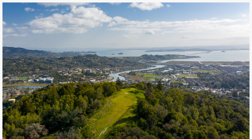
12 miles north of the Golden Gate Bridge

"King Mountain is the Crown Jewel of Bay Area Estate home sites. No other property combines King Mountain's privacy, views, verdant natural surroundings - amidst thousands of acres of public open space, abundant water supply, and ability to live totally off the grid; yet just minutes away from shopping, cafes, and restaurants, and only 12 miles north of the Golden Gate Bridge,"