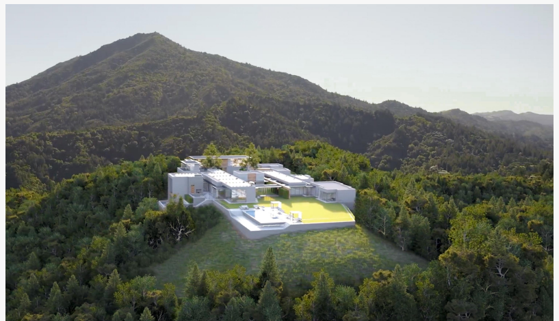
Create the legacy compound of your wildest dreams