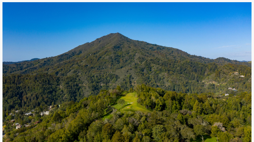
King Mountain Estate, Kentfield, CA