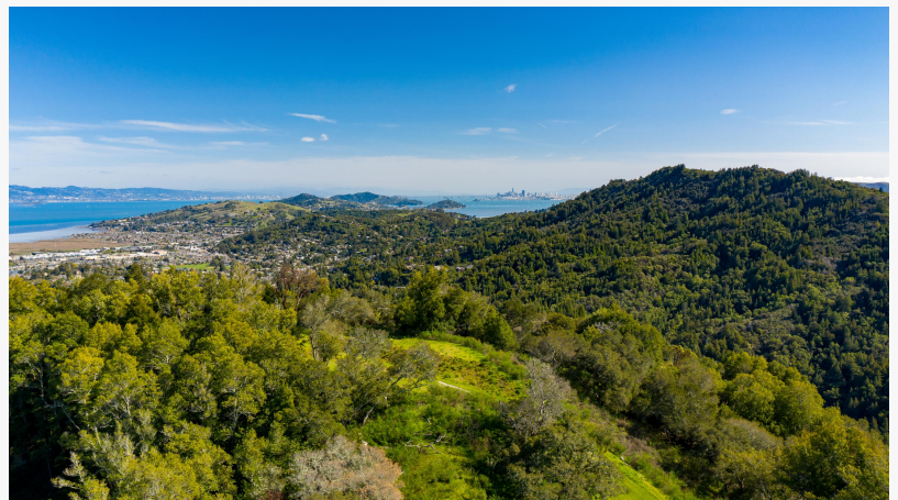
140 Acre Ridgetop Parcel

"Though there are many incredible homesites in the Bay Area, there's only one King Mountain