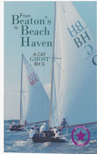
From Beaton's to Beach Haven: A Cat Ghost Bh G

Ghost's class originates from 1922. In 1924, it was recognized as a racing class under the name A Cat. In a class unique to Barnegat Bay in New Jersey, Ghost has proven to be more than just a boat—she has also proven herself to be a great narrator of tales about passion, preparation, and perseverance. From the countless times she has raised her sail to the several racing championships she has won from 1994-2000, Ghost also exudes everlasting beauty and excellence in her sophisticated and intricate craftsmanship and construction. Photos paired with explanation take the reader from making patterns and preparing the woodshop to a celebratory launch at Beaton's rigging dock. An account of Ghost's initial misadventures on the