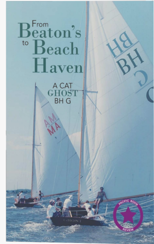
From Beaton's to Beach Haven: A Cat Ghost Bh G