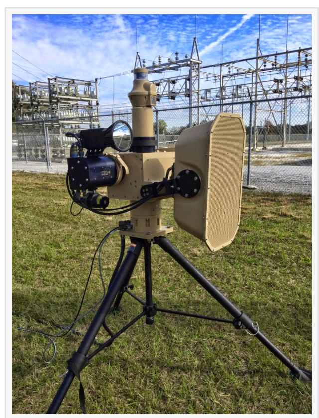
'Best of Industry' Continuous Persistent 360-Degree

TIR Hydra™ combines a Thermal Radar™ with an IR Illuminated Pan-Tilt-Zoom (PTZ) camera; when Thermal Radar™ detects a perimeter threat, it sends an HTTP slew-to-cue command to the PTZ for enhanced intelligence and target confirmation. The use of thermal imagery to detect people and objects is a premise widely accepted in military, industrial