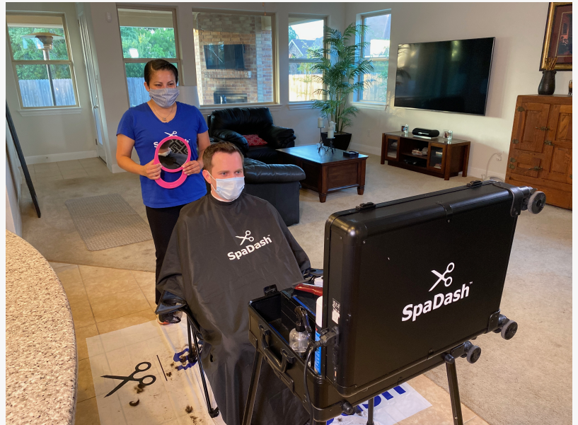
Mobile Haircut Delivery