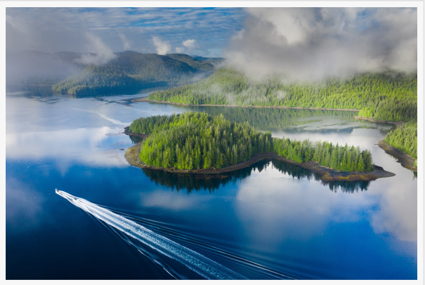
The beauty surrounding Waterfall Resort Alaska while fishing makes the experience that much more memorable.

A 90-minute flight from Seattle, Waterfall Resort guests are greeted at the Ketchikan airport and taken to the resort by float plane. Anglers of all skill levels embark on expertly guided sport-fishing excursions to land king salmon, silver salmon, halibut, ling cod, and more. Southeast Alaska's breathtaking landscape is filled with awe-