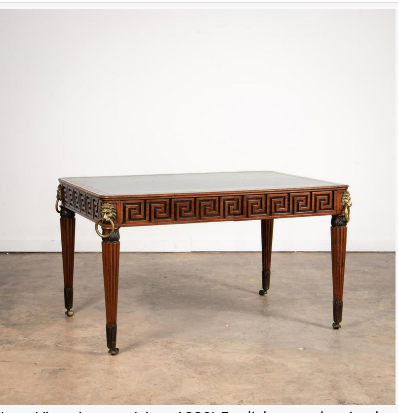
Late Victorian era (circa 1880) English part ebonized mahogany library table in the Regency taste, previously sold through Sotheby's and Christie's (est. $8,000-$16,000).

Paintings by European artists will be led by a watercolor and gouache on