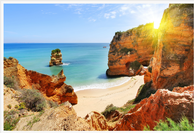
One of the many golden beaches in the Algarve, Portugal!

The Ideal Homes International team has over 20 top-caliber professionals with several years of experience and a wealth of knowledge in the market, making it relatively easy to select and buy the best property available. The categories of solutions offered by the