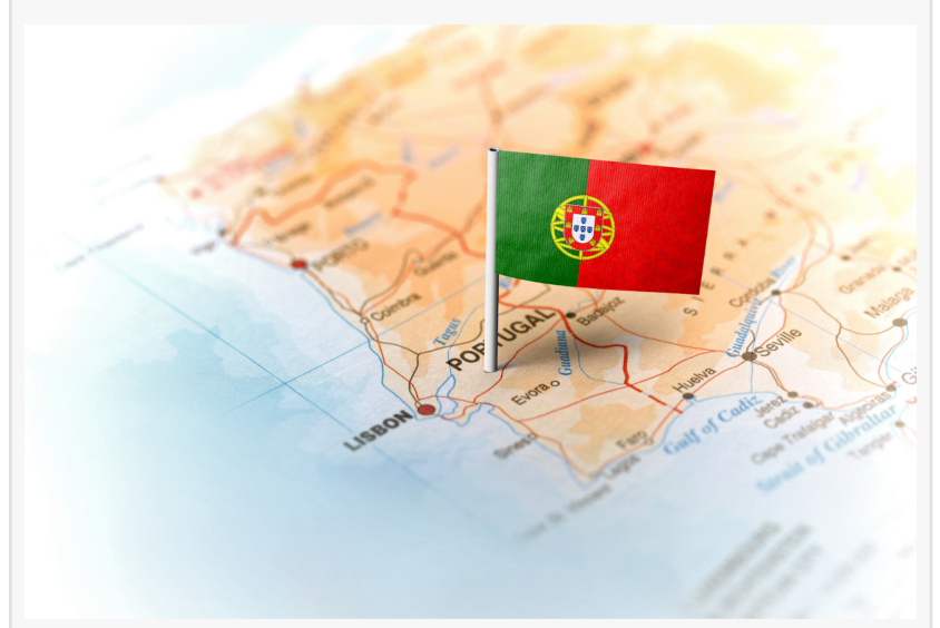
The Algarve - A popular holiday destination!

firm include <u>mortgages</u>, rentals and property management, currency exchange, and legal and tax affiliates.