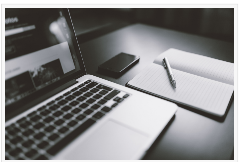
Ideal Homes International Introduces Property through Techonology

The Algarve has grown in recent times to become one of the fastest-growing real estate markets in Portugal and probably across Europe. Ideal Homes International has undoubtedly played a significant role in driving the growth of the market.