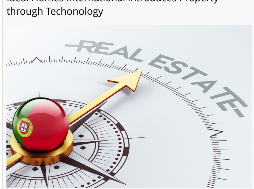
Portugal's Real Estate Market is in High Demand

The increasing number of amazing reviews from clients in Portugal and other parts of the world is a further reiteration of the agency's commitment to providing real estate investors with the best possible experience.