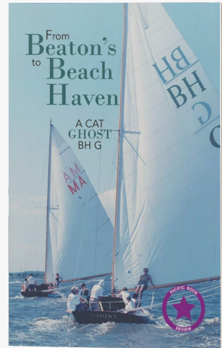
From Beaton's to Beach Haven: A Cat Ghost Bh G

"One of the most important things in this world has to be a person finding their passion in life. Whether it is a hobby such as collecting items or a dream profession like becoming a writer, there are so many endless possibilities for people to find what they are passionate about. One thing people tend to love is the ocean, and in particular, there are people with a love and passion for boats and boating. As James Taylor once said, 'Being on a boat that's moving through the water, it's so clear. Everything falls into place in terms of what's important and