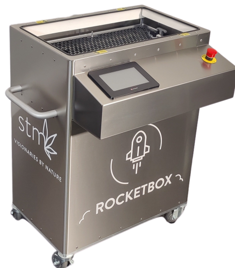
STM RocketBox 2.0 Commercial Pre-Roll Machine