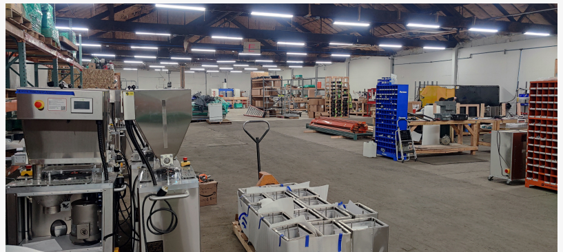
STM Canna is excited to announce its big move to a new, larger production facility

SPOKANE, WA, UNITED STATES, March 15, 2021 /EINPresswire.com/ -- The move according to the company's representative, is in response to the increasing demands of its market and a growing clientele base.