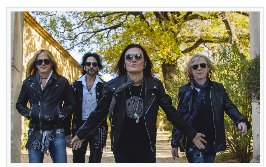
The Dead Daisies

"Chosen And Justified" is no standard lyric video. Expect effects, eye candy, rocket blasts, and pictures reminiscent of classic science fiction movies and their posters. Song lyrics in the heavens, right alongside the stars, and verses and stanzas accompany rockets as they race across the frames. Everything about the video achieves