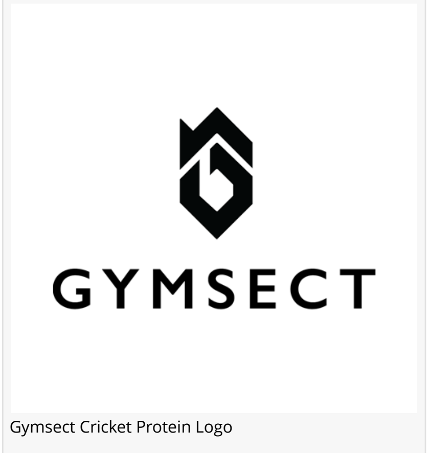
Gymsect Cricket Protein Logo