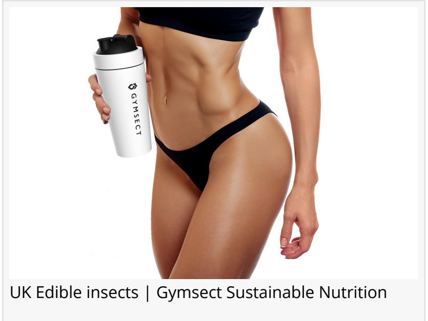
UK Edible insects | Gymsect Sustainable Nutrition

LONDON, UNITED KINGDOM, March 18, 2021 /EINPresswire.com/ -- This year, Gymsect announced Aesthetic Blend's immediate availability. The 2nd generation Cricket Protein Powder, an exciting addition to the product family, features a cutting-edge formula that provides an unrivalled and unprecedented nutritional profile, supporting athletic goals like never before. Aesthetic Blend is available to order now directly at gymsect.com