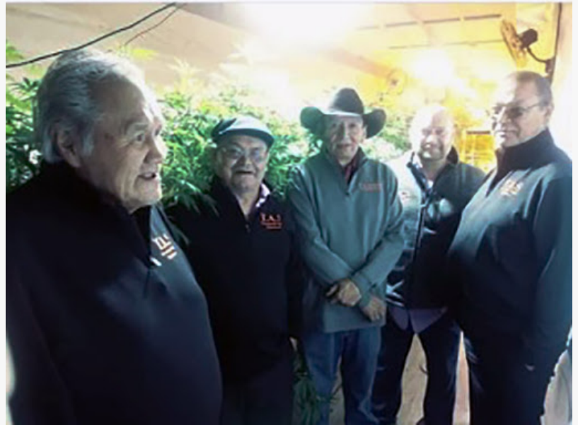
$ZAAG Econic First Nations

Econic, owner of a 15,000 square foot manufacturing facility builds, owns and operates containerized grow pods for the production of medical products. Foundation Farms business is to build, own, and operate indoor vertical farms for the production of leafy greens and associated food products. The collaborative arrangement will provide opportunities for mutual capital cost savings in both equipment procurement and assembly labor. Key components of the respective technologies such as LED lighting systems, pumps and controls and tanks are common to both companies. Secondly, both companies intend to share their respective market