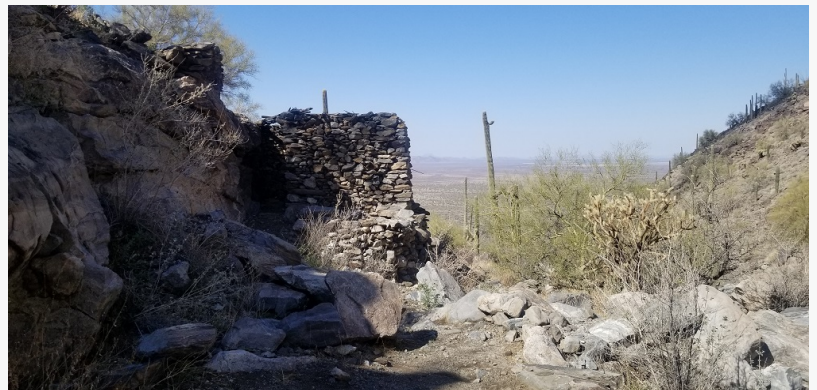
Don Joaquin's Rock House