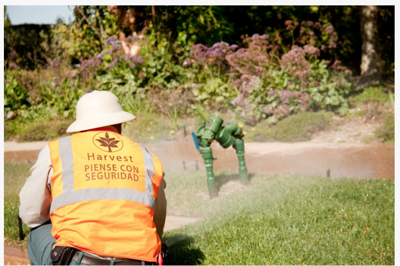
Harvest Landscape Water Management Division