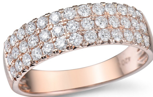
Ladies ring set with 0.75ct diamonds (39 pc). Ultimate comfort for everyday wear. Available in other metals by special order.