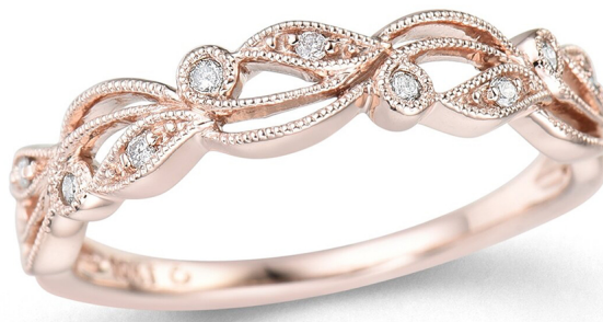
Ladies's rose gold diamond ring with round diamonds (0.06 ct - 9 pc). Available in other metals by special order.