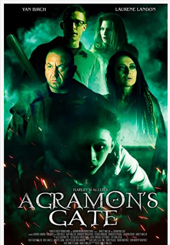
Agramon's Gate Poster