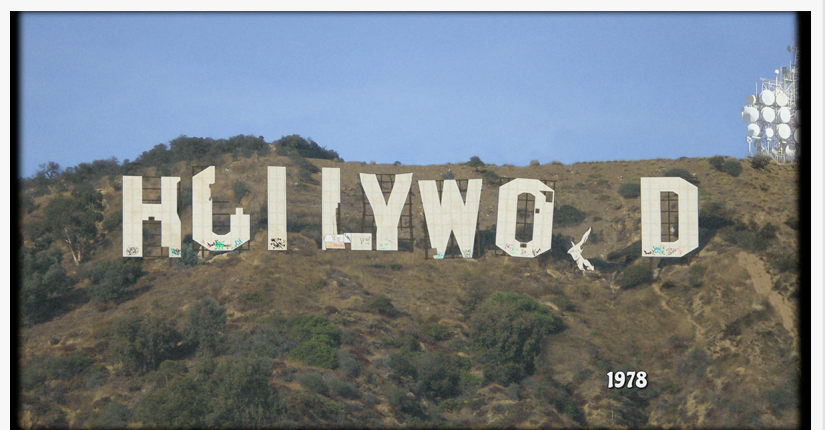
Hollywood Sign in decay c. 1978 pre-restoration