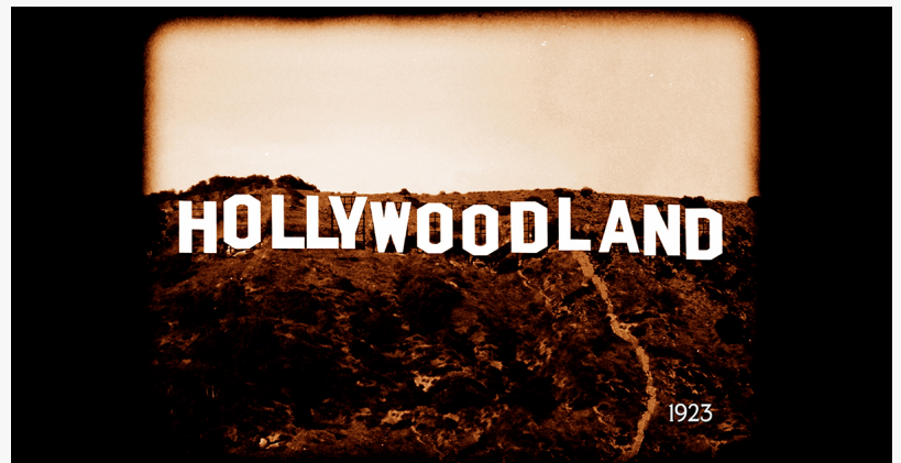
Hollywoodland Sign c. 1923

This press release can be viewed online at: https://www.einpresswire.com/article/537130756