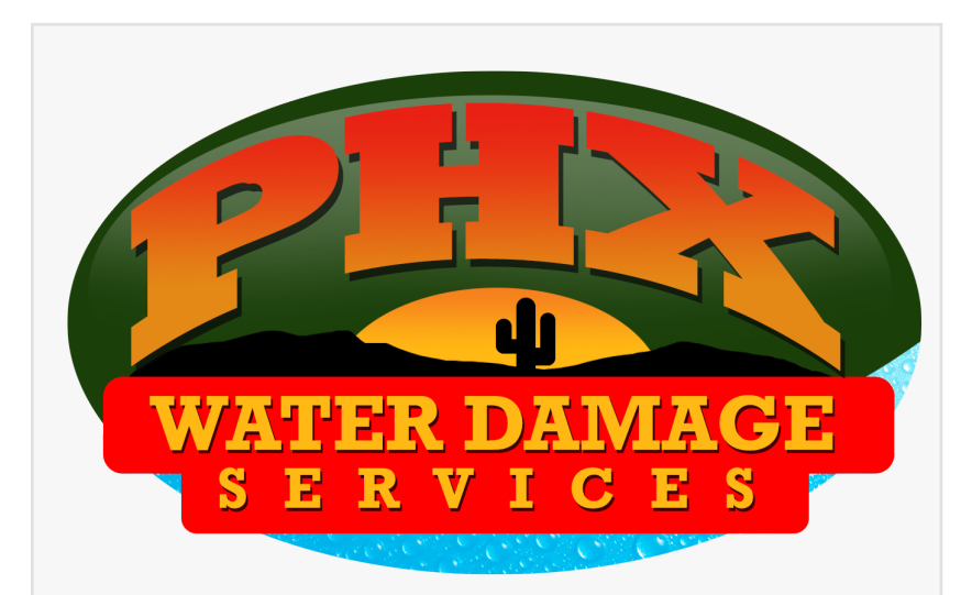
Phoenix Water Damage Services

The certified restoration experts at Phoenix Water Damage Services also