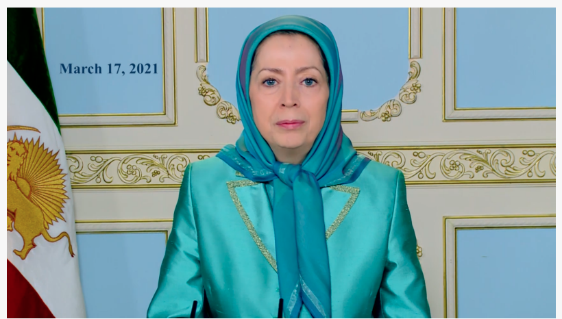
Mrs. Maryam Rajavi addresses the Senate Nowruz event, 2021

The senior senator from Maryland then added, "I am working with the Biden Harris administration and my colleagues in the Senate to continue to hold Iran accountable.... we all agree that Iran must never possess a nuclear weapon and Iranian support for human rights violations and terrorism must end."