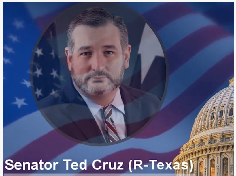
Sen. Ted Cruz at OIAC Senate Nowruz event, 2021