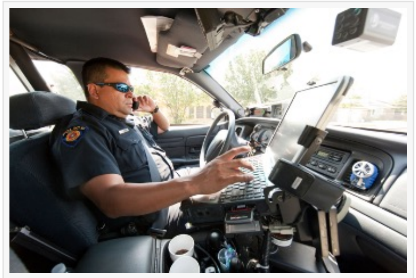
Officers in the field can receive warrant approval within minutes instead of hours.

Before eWarrants, the law enforcement officer would write a search warrant application and then drive it to the judge for review. eWarrants allow a law enforcement officer to complete and submit an electronic search warrant application to a judge on any day at any hour. The judge receives a notification about a pending application, then logs into the system to review the document. The judge