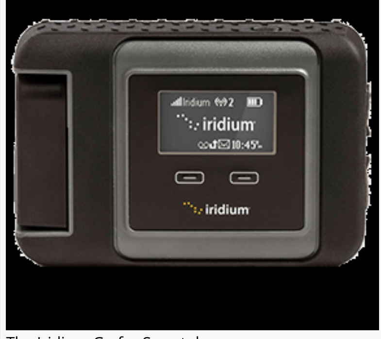
The Iridium Go for Smartphones

And today, people want to stay connected no matter where they go. Whether they are in a no-service zone, lost cell service during a thunderstorm, passing through the middle of nowhere, out to sea, on a mission in another country, wherever. People always want (and sometimes need) phone services.