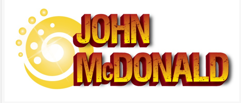
John McDonald: Singer Songwriter

This press release can be viewed online at: https://www.einpresswire.com/article/537181904