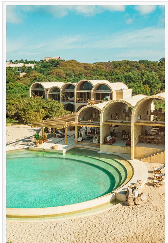
Located in Puerto Escondido, Oaxaca, Mexico, Casona Sforza is a boutique hotel whose concept places center-stage the value of being aware, contemplating, and understanding the beauty of an environment in balance.

In this peaceful haven, time passes at a pace that favors harmonious reflection amid all the