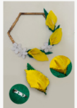
Handmade, felt, Calla Lily inspired Spring wreaths with accompanying statement brooch.

This press release can be viewed online at: https://www.einpresswire.com/article/537275900