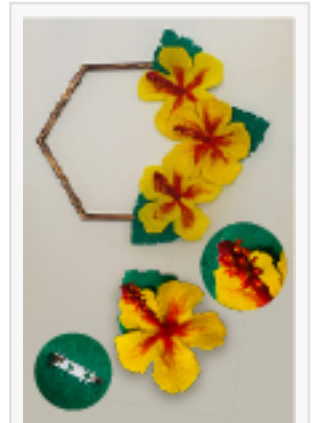
Handmade, felt, Hibiscus flower Spring wreaths with accompanying statement brooches

join the Ruby Bloome's Best and Beloved Group for inspirational stories and fun content.