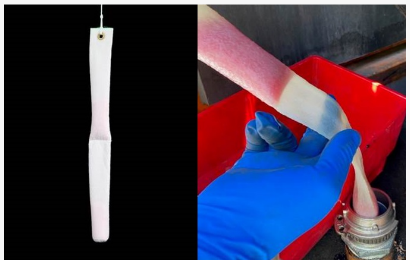
Easy Installation and Maintenance

often at the bottom of the list of properly managed assets in operations using diesel. However, as a career fuel management professional this should be exactly the opposite. The fuel that is allowed to enter your fuel system is a determining factor for how your boat, generator or diesel machine will support your operation. And in most cases, if the machine does not operate properly, the operation does not proceed as efficiently or effectively as it should.”