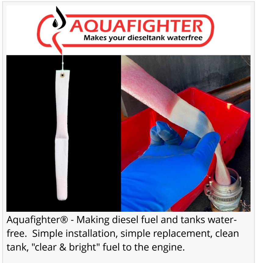
Aquafighter® - Making diesel fuel and tanks water-free. Simple installation, simple replacement, clean tank, "clear & bright" fuel to the engine.

ORLANDO, FL, USA, April 7, 2021 /EINPresswire.com/ -- Aquafighter® , a new technology for keeping fuel water-free, is establishing distribution in the marine market worldwide. Steve Schultz of DieselCare AS makers of Aquafighter®, "In 2020, our first year at market; we focused primarily on the fuel station market as those are our roots. However, we see the marine market as having quite possibly the most potential for our non-additive, non-energy consuming, easy to use fuel purifying technology."