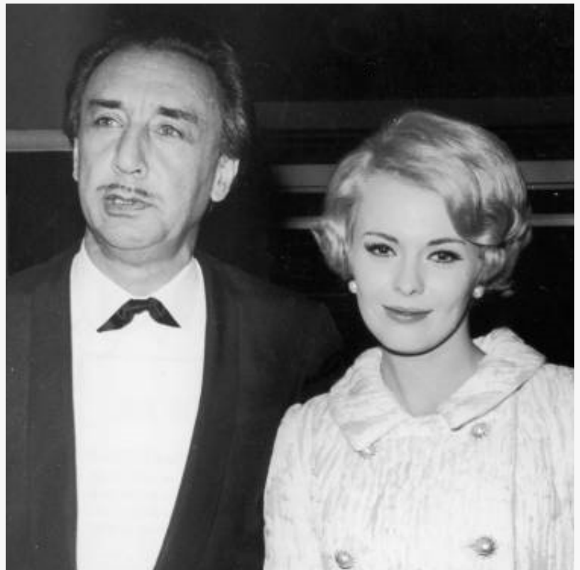
Romain Gary was husband to tragic suicide actress Jean Seberg.

LONDON, UNITED KINGDOM, April 2, 2021 /EINPresswire.com/ -- At their virtual Easter press conference on April 1st, Living Time Motion Pictures announced a slate of new productions for 2021-2022, headed by the biographical film ' Man of Promise ' about the life and work of multi-award-winning novelist Romain Gary. Four other features were also announced - including documentary 'In the Absence of the Author' as well as the forthcoming television series 'Crimes Past'. Attending the event, it was clear from the core focus being given to 'Man of Promise' that it is one of