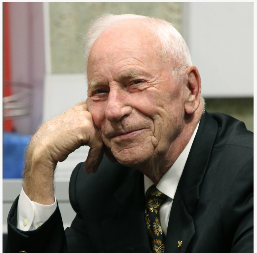
Apollo 15 Astronaut Al Worden

Danny Beyer Bookpress Publishing +1 515-918-0656 info@bookpresspublishing.com Visit us on social media: Facebook