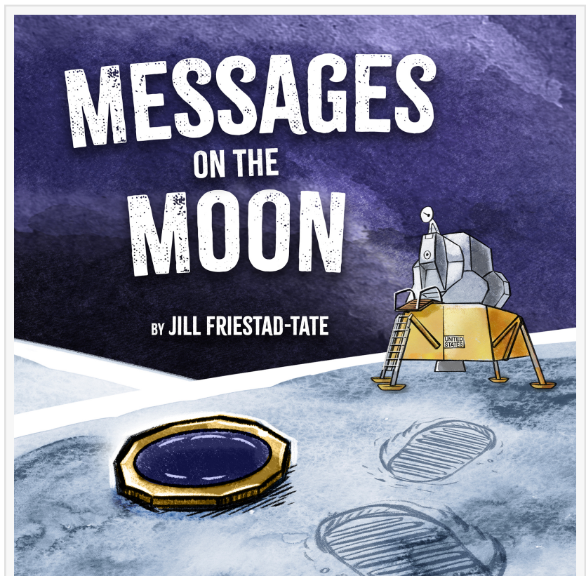
Cover of "Messages on the Moon" that details the story of Apollo 11 and the silicon disc.

All of the proceeds from sales of "Astronaut Al Travels to the Moon" and a portion of the proceeds from "Messages on the Moon" are being donated to the Al Worden Endeavour Scholarship which sends students and teachers from all over the world to Space Camp in Huntsville, Alabama.