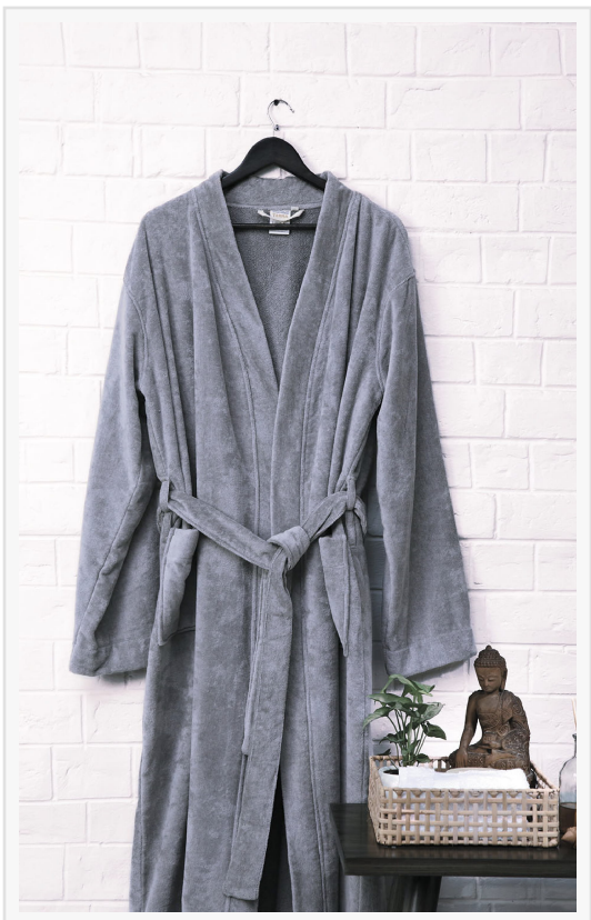
Artisans craft Terra Thread Home Robes from organic cotton.

Organic cotton sourced by Terra Thread is from rain-fed fields that are part of farmer co-operatives managed by Non-Government Organizations (NGOs). Farmers harvest long staple cotton from these pesticide-free fields. Workers then spin the cotton into yarn and weave it into extra-soft fabric, free from toxic dyes, formaldehyde and heavy metals that are common in conventional cotton textile manufacturing. After the fabrics arrive at garment factories, artisans design, cut and sew Terra Thread Home