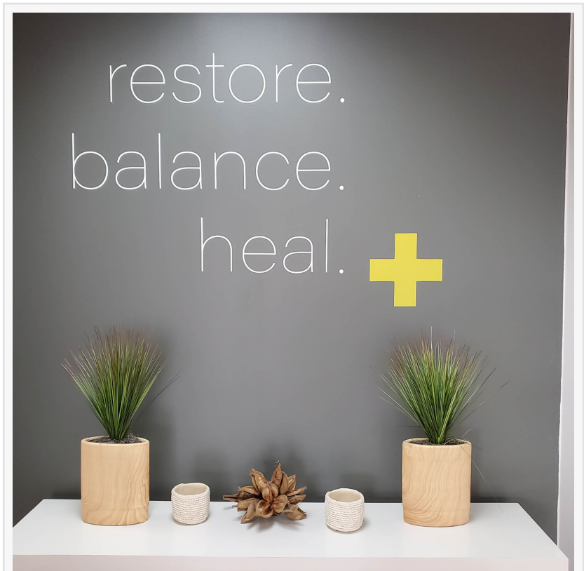
CBD drive- thru

That hasn't stopped major brands from pushing out a head-spinning number of CBD product lines, but it has left many consumers baffled. Now, the CBD industry is hiring its own experts to gain consumer