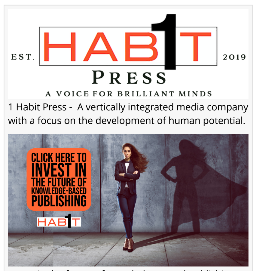
Invest in the future of Knowledge Based Publishing

We've created the 1 Habit Book Series Using a model that allows us to share 100 habits of extraordinary people in each book we publish. And, the last eight books we published have all been International Best Sellers. Our 1 Habit