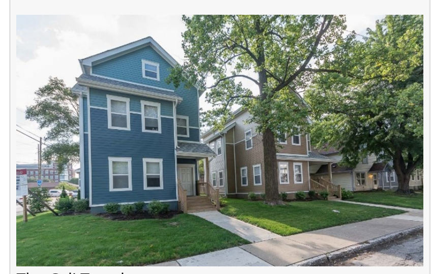
The Cali Townhomes