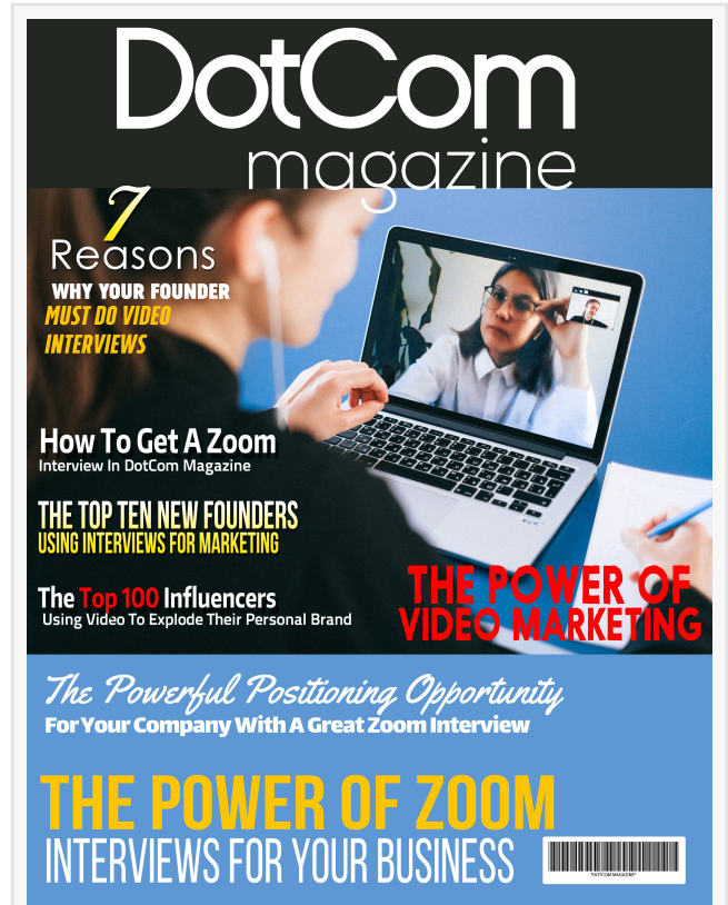
The Power Of Zoom Interview Issue

The Entrepreneur Spotlight Series has included many high-profile leaders, including Inc 5000 founders, Ted