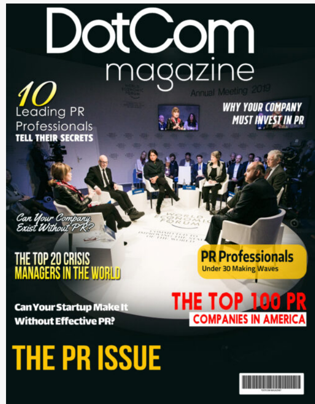
The DotCom Magazine PR Issue