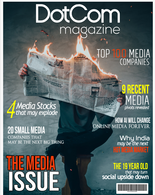
The DotCom Magazine Exclusive Entrepreneur Spotlight Series