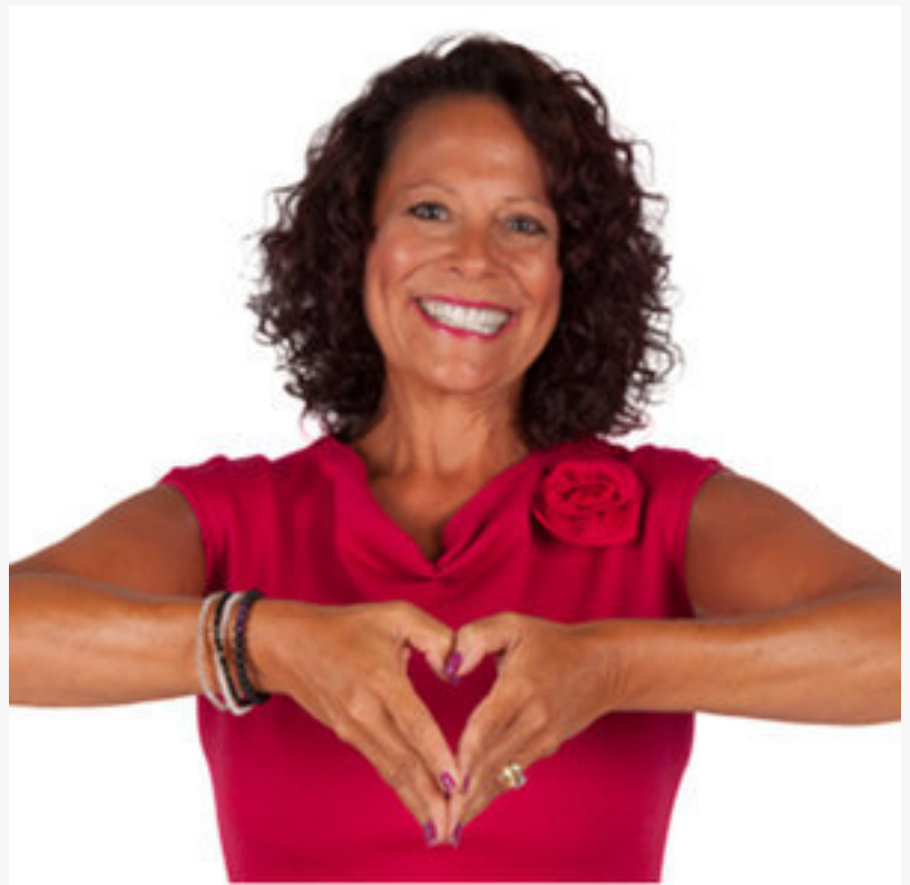
Helping Women Entrepreneurs Succeed