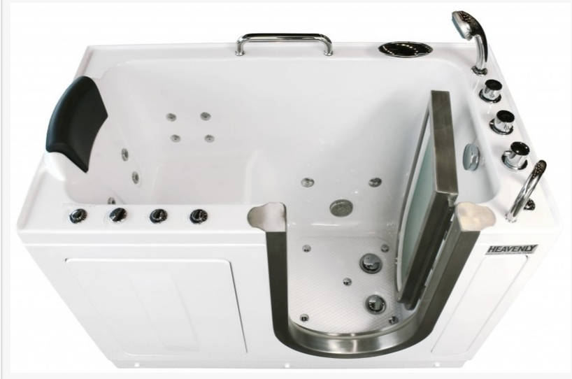
PORTABLE 'Best of Industry' Top Rated Walk-in Tub

Daily Hygiene Needs. Avoid High Remodeling Costs. Fully-Equipped Tubs are Ready-to-Go with All Necessary Components. Complete Mobility is the #1 Benefit. Custom Financing Solutions are Available. Call to Verify.