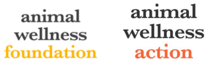
Animal Wellness Brands Logo