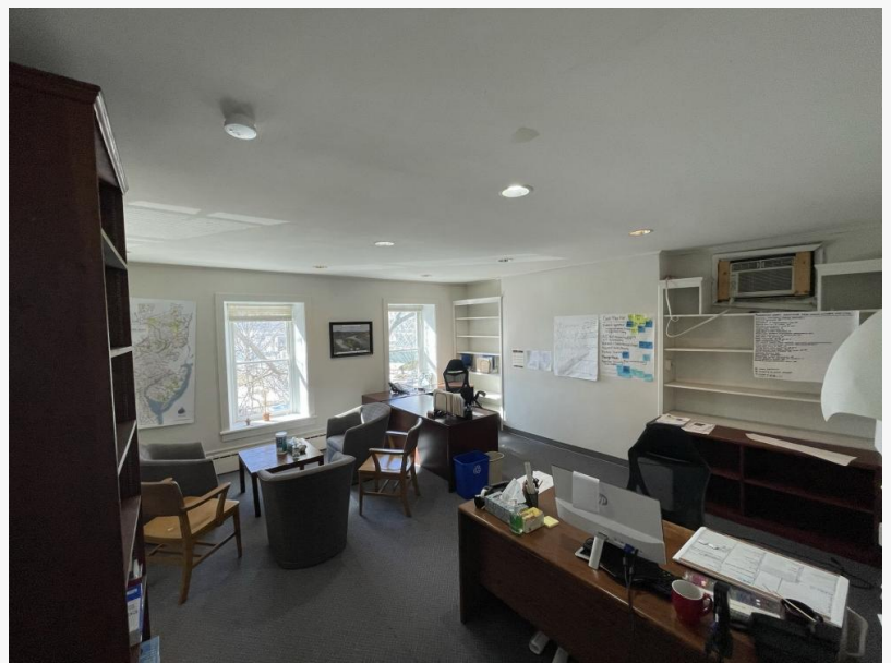
Business A District