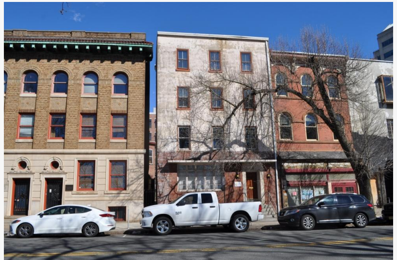
4,064+/-SF 4-Story Building

TRENTON, NJ, USA, March 24, 2021 /EINPresswire.com/ -- Max Spann Real Estate & Auction Co is pleased to announce the Auction of a Downtown Trenton office building located at 118 West State Street in the City of Trenton, New Jersey. The Property will be sold in an online only Auction concluding Wednesday April 21, 2021 at 11:00AM. Bidders may bid on their computer or through the Max Spann phone app.