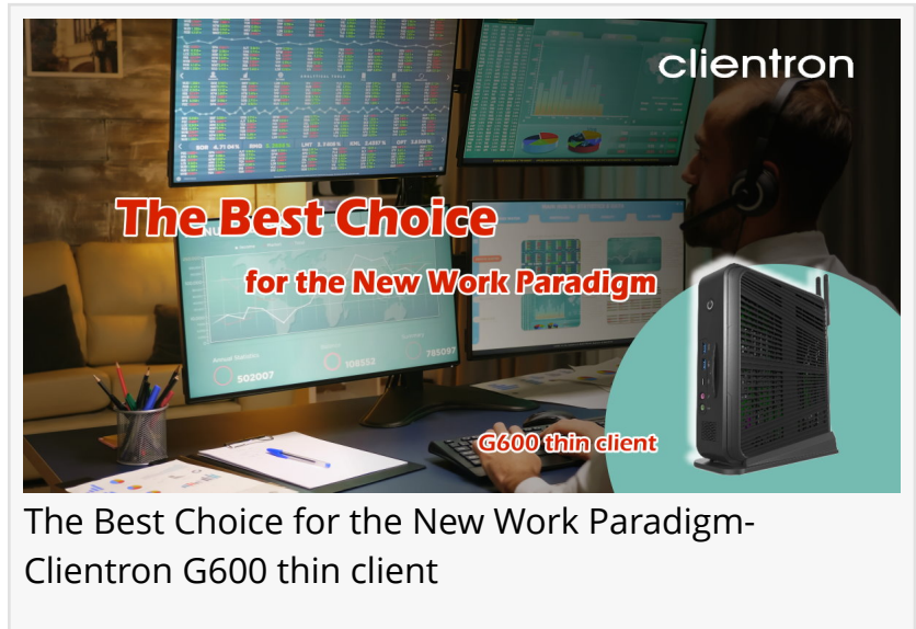
The Best Choice for the New Work Paradigm- Clientron G600 thin client

NEW TAIPEI CITY, TAIWAN, March 25, 2021 /EINPresswire.com/ -- Clientron Corp., a world-leading supplier of thin client and embedded systems, unveils its latest thin client - G600 which is geared towards remote users who use multiple high-resolution display outputs with low power consumption and facilitates the organizations having demands for high security and multiple 4K displays to run the operation smoothly and effectively in a VDI working environment.