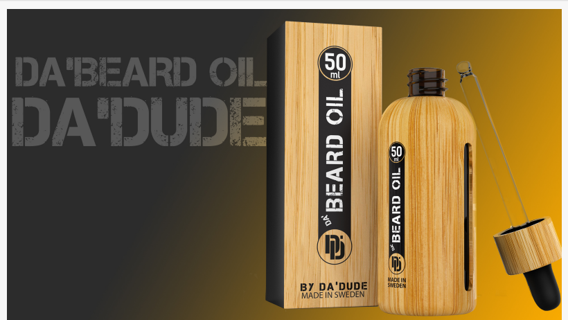
Unique Bamboo Bottle