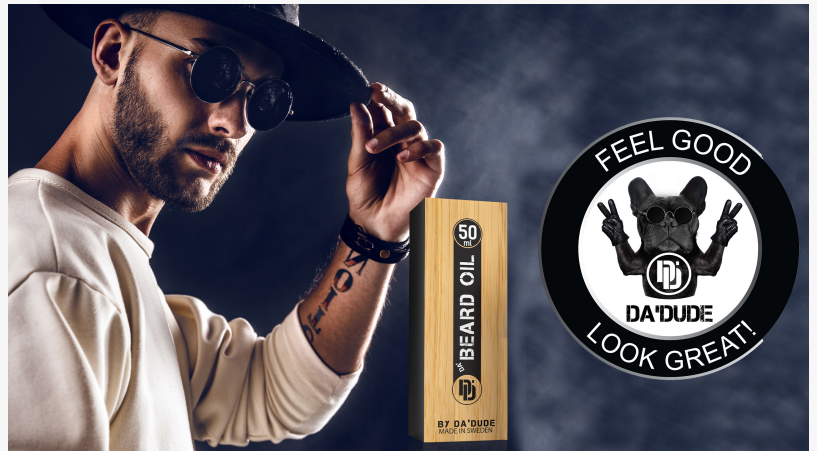
Beard oil Vegan

This press release can be viewed online at: https://www.einpresswire.com/article/537496616