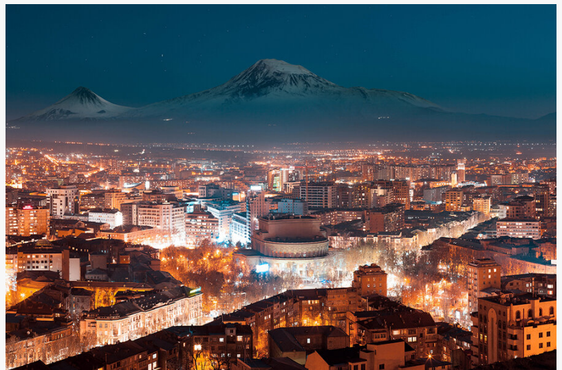
Armenia becomes a well-known country with high-quality offshore software development services

Software development outsourcing is a business model where a company decides to hire a third-party dedicated developer or a software development house to cover its technical requirements.