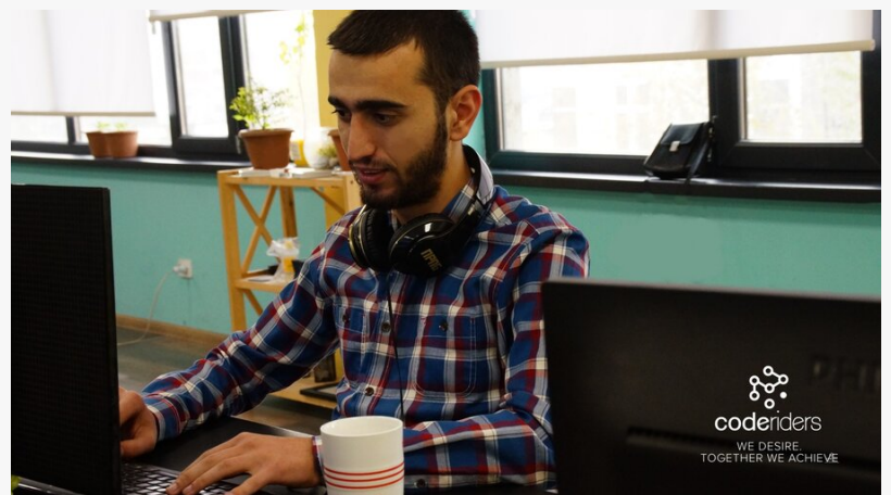
Offshore software development is very popular in Armenia