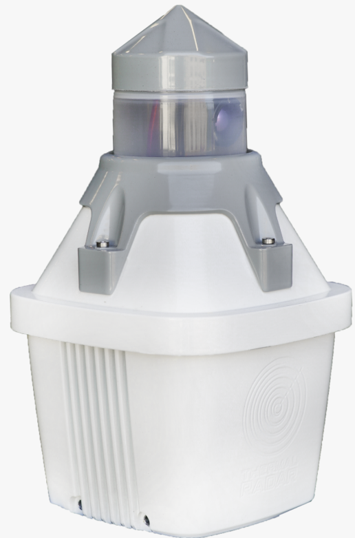
801-762-6800 TIR #1 Custom Threat Detection System