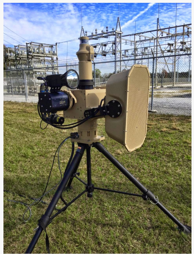
'Best of Industry' Continuous Persistent 360-Degree

Thermal Radar™ is an award-winning and patented perimeter security solution that provides continuous 360-degree situational awareness. Thermal Radar™ rotates best-in-class FLIR Boson™ thermal sensors and incorporates custom-written, edge-based analytic detection algorithms to detect, classify, and geo-spatially locate threats within a perimeter.